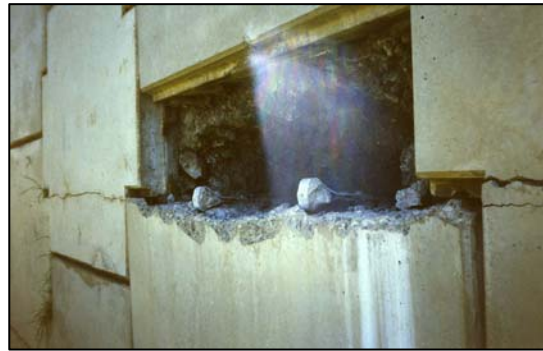
Figure 6. Dunswart