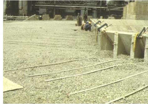
Figure 5. Vanderbijlpark

In 1998 however, RESA was alerted to cracking of the panels. Investigation determined that the problem arose because of expansion of the backfill caused by reaction of lime in the fill to ingress of water. The overall structural integrity of the structure is not affected, but the cracked panels are unsightly and ongoing repairs are necessary. The use of expansive backfill cannot be entertained in MSE structures and the material is not recommended. (See Figure 6.)