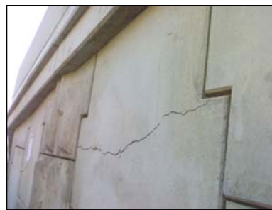
Figure 7. Western Freeway, Durban

RAP was taken as backfill on the Western Freeway Durban structure constructed during 2006. The internal angle of friction was 30° degrees. 100% passed the 20 mm sieve and zero passed the 75 micron sieve. The interlock of the binder coated aggregate fragments are subject to significant residual viscous behaviour resulting in time delayed post construction creep and consolidation of the fill. In the case of the Western Freeway this led to rotation of the crash barrier during the construction process and consequent bursting of the cladding. The settlement of the fill was monitored and once it became negligible the cracked panels were repaired and the structure was brought into service. RAP, mixed 50:50 with sandstone has been successfully used on another project. RAP should not be used on its own however and should be mixed with approved backfill for use as backfill in MSE structures. (See Figures 7 & 8)