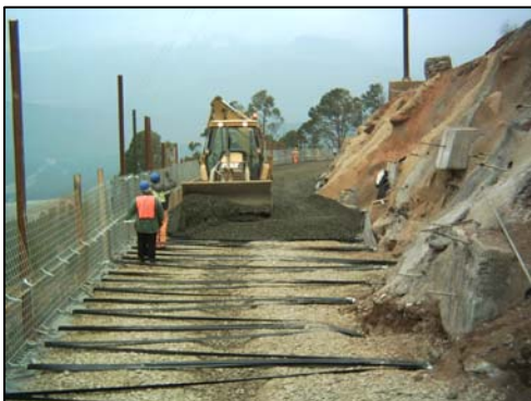
Figure 11. Langeni – synthetic reinforcing strips