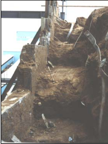
Figure 4. Grootegeluk

Aeolian soils of the interior, are sandy soils which have undergone redistribution by wind action and cover almost half of Southern Africa. Grading envelopes of these sands may be uniform except for varying amounts of clay. They could well be intermediate with clay content above 20%. When used in MSE structures care should be taken to compact the backfill adequately to prevent future collapse settlement. Figure 4 shows failure of an MSE structure in Limpopo, South Africa, due to inadequate compaction and subsequent collapse settlement.