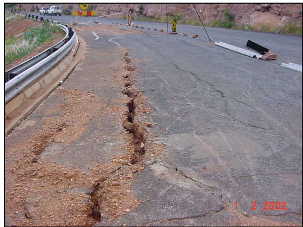
Figure 2. Kloofpass bridge approaches

which is defined as the additional settlement and stress changes that a soil undergoes when its moisture content increases. It is postulated that the clay bridges in the inadequately compacted backfill collapsed as they became saturated and progressive failure of the MSE ensued (Figure 2). Piles have subsequently been driven through the failed MSE embankment and support bridge decks replacing the approach embankments.