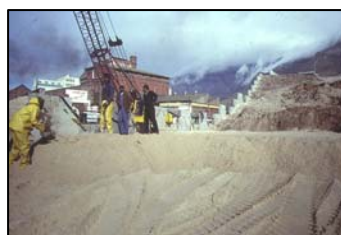
Figure 3. Church Street under construction

A further concern with single sized fine sands is leaching or spilling of backfill through the cladding. A durable geofabric backing is required behind all joints, and great care needs to be taken with structures alongside waterways and the sea that are subject to changing water levels. (Figure 3)