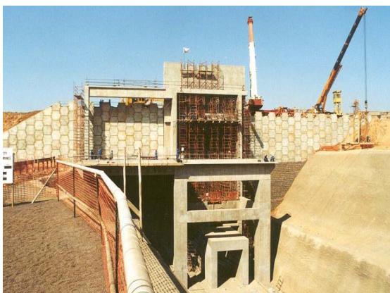
Figure 1. Cru-Klipfontein tip wall

The structure is a 30m high tip wall placed 15m below natural ground level and 15m above natural ground level. The backfill used below ground was residual felsite (very fine grained volcanic rock) with 16% less than 20 micron. The above ground backfill was hillwash with 25-30% passing the 20 micron sieve and friction angle ranging from 27.7 to 32.5 degrees. Post construction settlement of the upper part of the structure bearing on the lower structure is almost linear and is ongoing. Settlements of the order of 30 mm per year occurred between 2000 and 2006 with little sign of slowdown. These settlements have caused movement in the cladding, but do not effect the overall integrity of the structure. (See Figure 1)