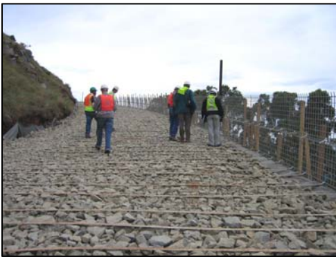
Figure 10. Langeni –galvanized steel reinforcing strips

A durable shale backfill has also been successfully used at the Grootegeluk Mine – Limpopo RSA.